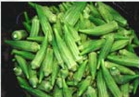
Figure 3. Ochro pods between 7.5 to 12.5 cm long at ideal harvest maturity stage.

Pod texture can also be used to determine harvest maturity. The texture should be crisp, moist, and fleshy inside. Over-mature pods are tough, dry, and pithy (hollow) inside. Pods with tips that will bend between the fingers without breaking are too over-mature and tough. Seed size is also indicative of pod maturity. The seeds should be small and succulent. Ochro pods should be harvested before the seeds are more than half developed in size. Over-mature pods have large dry seeds.