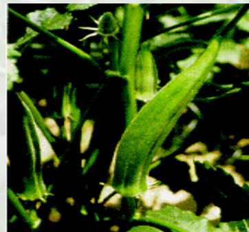
Figure 4. Bright green colour of ochro ready for harvest.