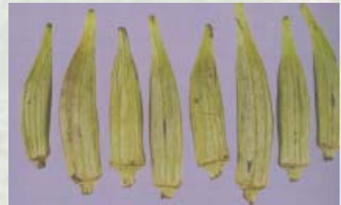
Figure 9. External pod discoloration of bruised and skin-damaged ochro.