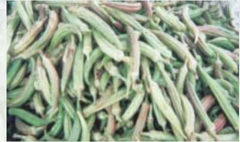
Figure 8. Torn stems are undesirable and should be cleanly cut before

Ochro is packed in various sized containers, differing in volume and weight, depending on the market destination. Domestic markets usually receive ochro in sacks or baskets, although these packages provide minimal protection to the contents. Fiberboard cartons are the most common type of package for export markets. Typical sizes used are 4.5 kg (10 lb), 7 kg (15 lb), and 14 kg (30 lb). The cartons should be well ventilated and strong. The carton should have a 275 psi bursting strength in order to avoid collapse while stacked on a pallet. One-piece self-locking cartons or two-piece telescopic cartons are the most widely used package configurations (Figure 10). Ochro should be cooled and sent to the market as soon as possible after packing.