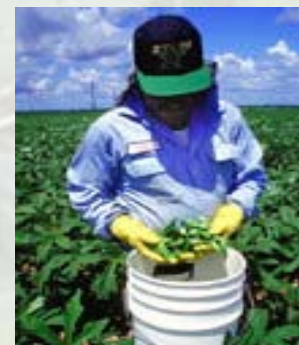
Figure 5. Rubber gloves and a long sleeve shirt provide protection to worker at harvest.

Pods should be cut from the plant with clippers or a sharp knife. A small length of the stem, approximately 1 cm (0.4 in) long, should remain attached to the pod with a smooth neat cut at the end. They may also be snapped off by hand, but the stem end will need to be re-cut to remove the torn tissue at the edge. Pods should be harvested and handled with care, since they discolour and darken quickly when bruised or if the skin is damaged. Plastic pails or small baskets with a smooth internal lining are ideal harvest containers.