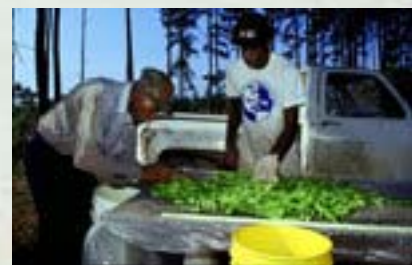
Figure 7. Elimination of organic matter and other types of debris from the harvested pods.

Cleaning of ochro generally involves the elimination of leaves, stem sections, and other types of debris from the pods. Broken pods should also be discarded. This should be done in the packing area while the pods are spread on a flat surface (Figure 7) or conveyor belt. Ochro should not be washed, since this would lead to a greater incidence of postharvest decay.