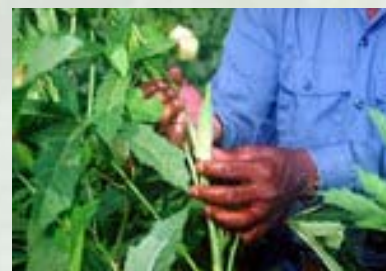
Figure 1. Well-formed ochro pod ready for harvest.

Typically, ochro should be harvested when the pods are 7.5 to 12.5 cm long (3 to 5 in) (Figure 3). However, in some situations there may be a strong market demand for smaller sized ochro and harvest stage should be adjusted accordingly. Due to the rapid rate of growth and development, ochro should be harvested every other day to ensure pods remain within the marketable size range. Regular picking increases yield and prevents the pods from becoming overmature. Ochro pods should be harvested while still tender and with immature seeds. Pods with tips that bend between the fingers without breaking are undesirably tough. If left to grow, the pods will attain lengths of 20 cm (8 in) and up to 2.5 cm (1 in) or more in diameter.