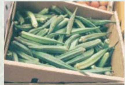
Figure 10. Two-piece telescopic fiberboard carton used to pack ochro for export.